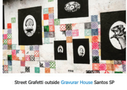
Street Graffiti outside Gravurar House Santos SP