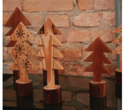
Rustic recycled wooden Christmas Trees by Mudo Reciclagem .