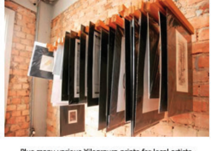
Plus many various Xilogravura prints for local artists.